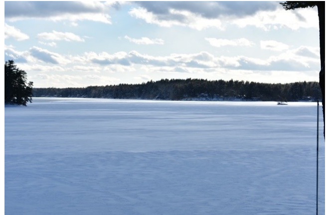
A December view from 21st Street (looking down the lake).