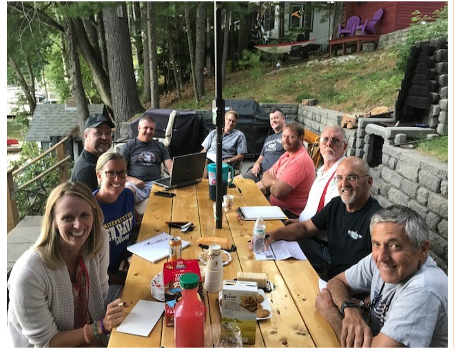
August 2019 Board Meeting